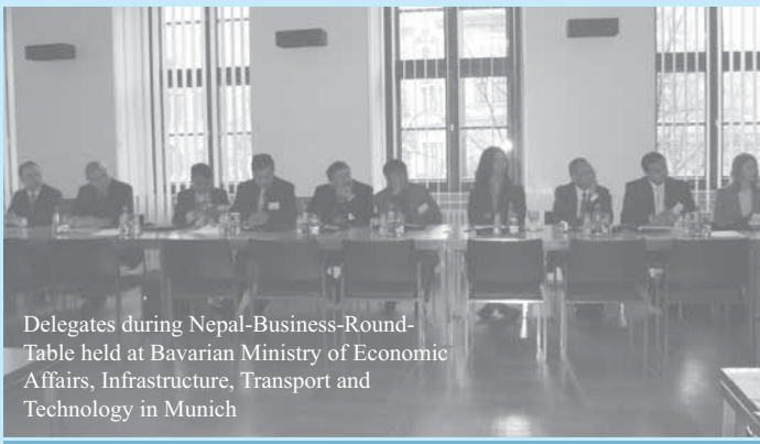
Delegates during Nepal-Business-Round-Table held at Bavarian Ministry of Economic Affairs, Infrastructure, Transport and Technology in Munich

The participants also had business talks with their concerned counterparts to explore business in their sectors.